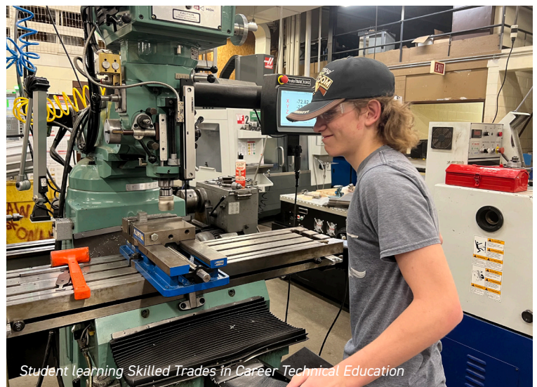
Student learning Skilled Trades in Career Technical Education